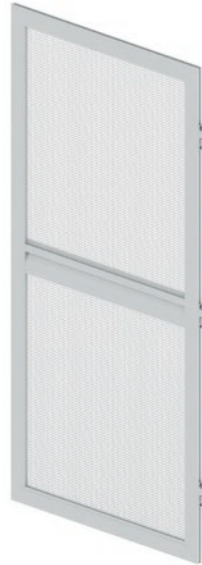
ISD E Swing frame single