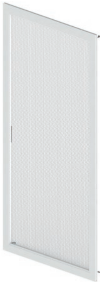
ISR Clamping frame