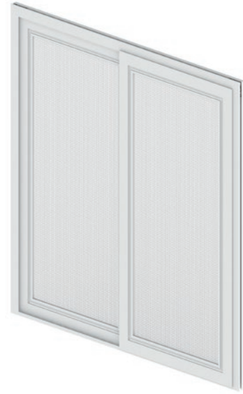
IST Z Slide frame with frame